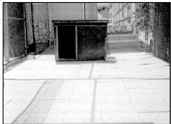
Pavers help keep this pen clean and attractive

After the panels are laid out and wired down, an old garage door can be laid over a portion of them to provide shelter from rain, and a shaded area. A